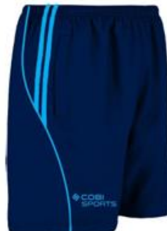
School Shorts (available from COBI Sports) (available from COBI Sports)