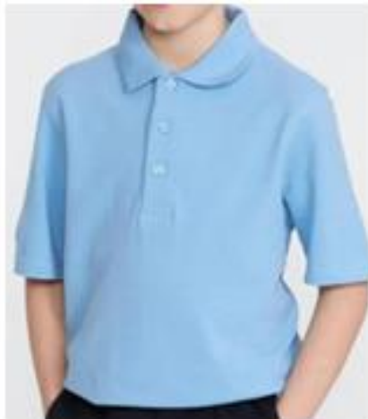
Light Blue T-Shirt (Polo or round neck option)