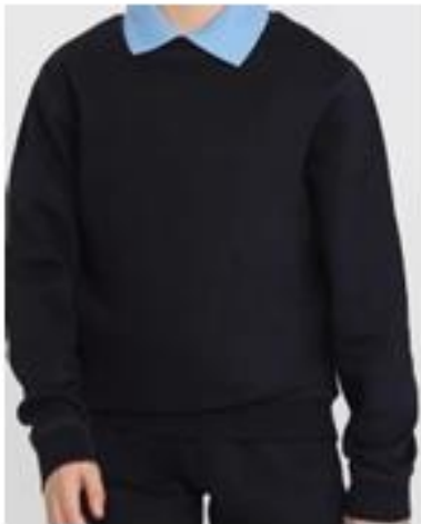
Plain Navy Sweatshirt