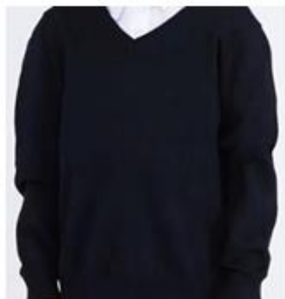
Plain Navy V-Neck Jumper