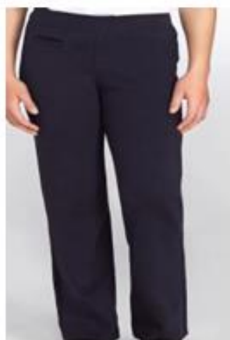
Navy Trousers for Girls