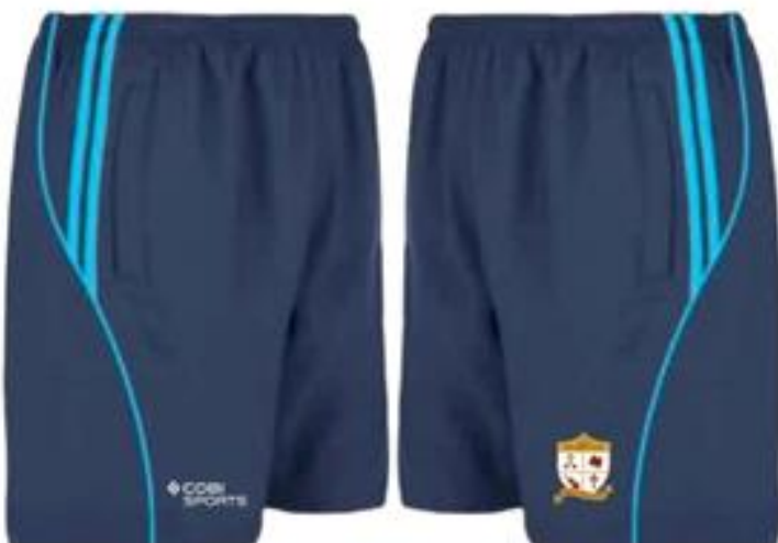
School Shorts (available from COBI Sports)