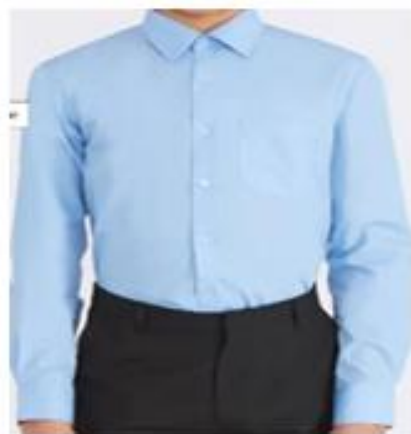
Light Blue Shirt (short sleeve also permitted)